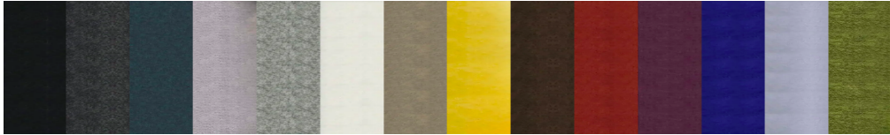
*Colors shown here are from EzoBord's current selection, and do not indicate the colors soon to be announced.

EzoBord is known for their wide array of colors, patterns and materials, providing bold pops of character with each new design. On January 9th, EzoBord will announce a new color collection with rich, beautiful shades to bring even more customization and life to your office, lobby, and work spaces.